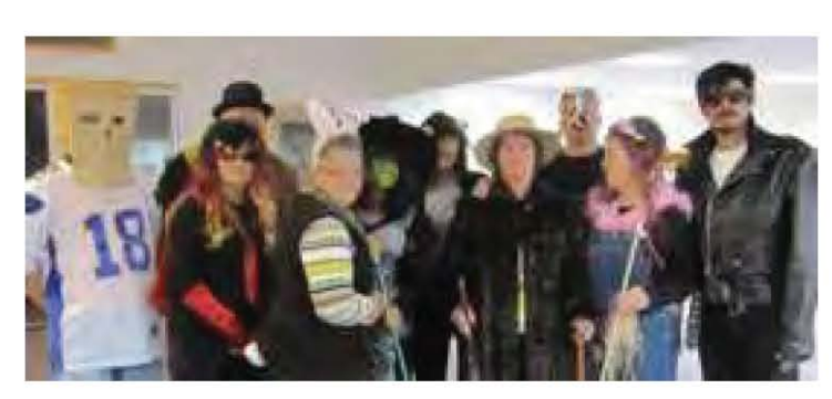
Ellendale Lions Club at their Halloween Party. Money from costumes and games was raised for our OPERATION CHRISTMAS event in Dec. that supplies gift cards for those in need.